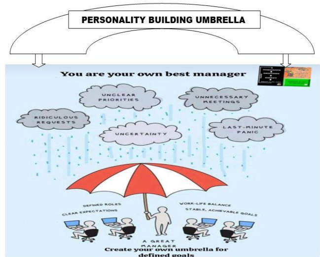
Figure 2: New exogenic factors surrounding a cloud of worries broaden the amplitude of electrolyte disorders. It enables one to create their own umbrella for defined goals.

unnecessary meetings, and last-minute panics, which occur in office workings. On these lines many parallel cloud forming situation can occur unexpectedly. Furthermore, personal body factors growth accentuated by overcoming a wide range of hypo and hyper situations that disrupt the balance of essential electrolytes such as sodium, potassium, calcium, magnesium, chlorides, and phosphorus. These ions are crucial for the functioning of interconnected sub-biological networks that facilitate production, consumption, and waste elimination. These advancements support and demonstrate potential improvements in challenging mental states, offering a way for celebrities to avoid future distresses.